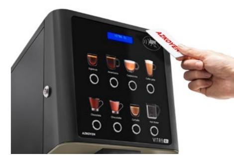
RFID Reader Kit For product recharge card or cashless systems