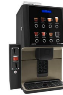
Validator module kit Ready to install a coin validator.