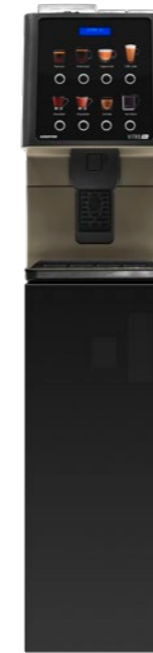
Base cabinet kit Ready to install a coin validator. (850 mm.)

It is also the perfect solution for a coffee service in convenience stores as well as for hotels, where breakfast needs to be good but also fast. It offers a pleasurable experience with an attractive, simple and functional design.