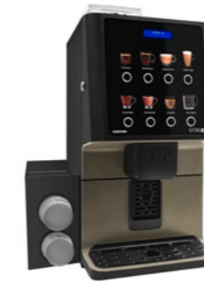
Cup module kit For dispensing cups.