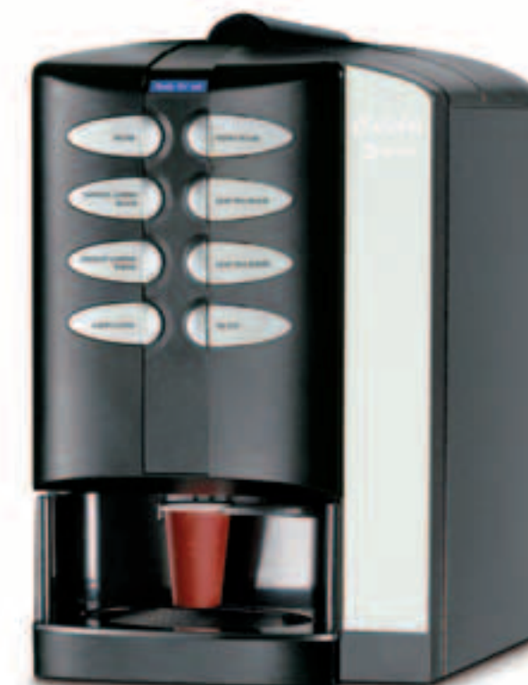
Leaf Tea model